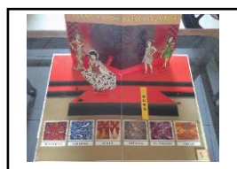
Picture 10. Batik