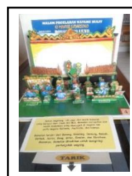
Picture 12. Wayang and gamelan