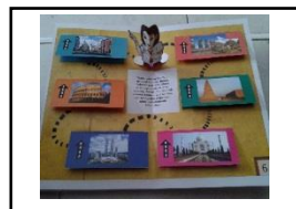
Picture 11. Indonesian group culture in internasional events