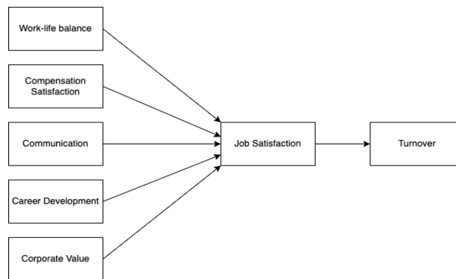
Figure 2. New Conceptual Framework

To conclude, the hypothesis for job satisfaction and organizational culture has supporting contributing factors to the decision to resign from the company. Meanwhile, compensation benefits, especially incentives and pay growth, become the determinant factors for them to leave the company. However, this research has found that a couple of setback factors for Fakta Retail to retain the Millennial employee come from sub-factors from job satisfaction and organizational culture, which are communication, career development, work-life balance, and corporate value. This finding has shown new determination factors and conceptual framework for further research, as presented below.